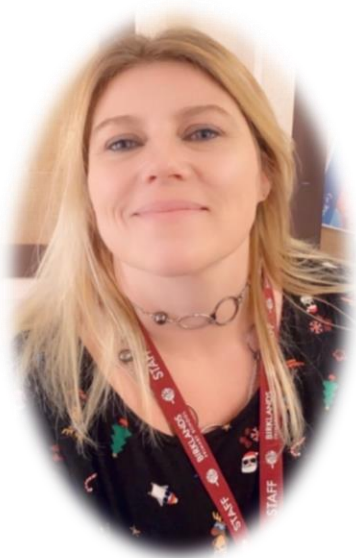
Mrs Lean Foundation