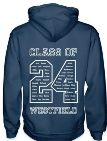
Leavers Design 3

Pupils voted for their favourite style. The following option was chosen by the majority. The hoodie will be burgundy.